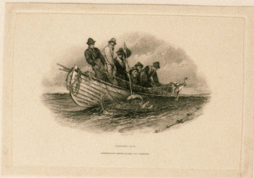
A.B.N. - Ottawa