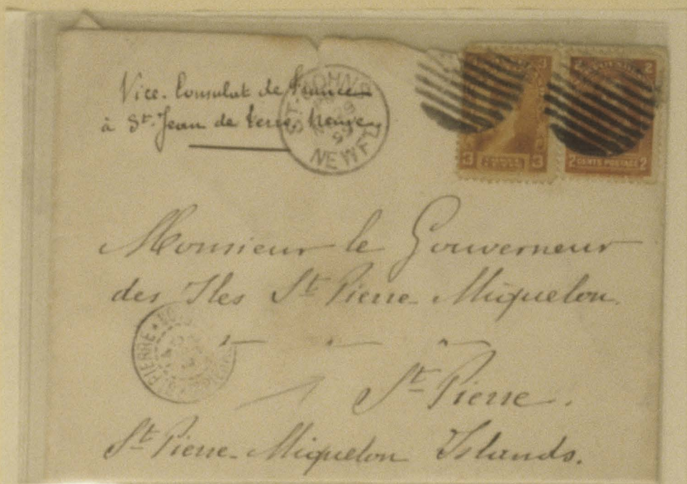
ROYAL FAMILY ON COVER ST JOHNS TO ST PIERRE - 28 NOV 1899 5¢ UPU FOREIGN RATE