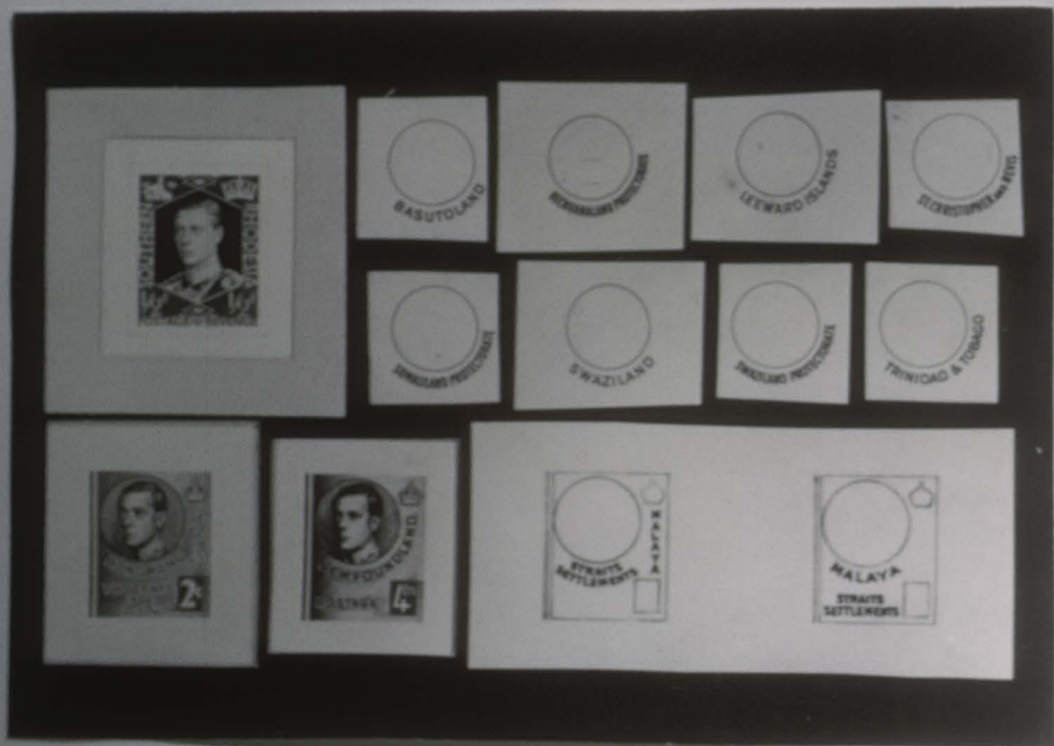
PHOTOGRAPH OF ARTIST'S SKETCHES SHOWING HOW VARIOUS COUNTRIES COULD BE ACCOMODATED BY USING ONE BASIC DESIGN.