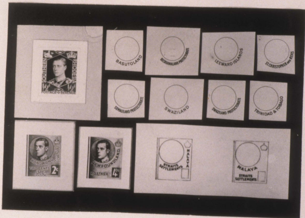
PHOTOGRAPH OF ARTIST'S SKETCHES SHOWING HOW VARIOUS COUNTRIES COULD BE ACCOMODATED BY USING ONE BASIC DESIGN.